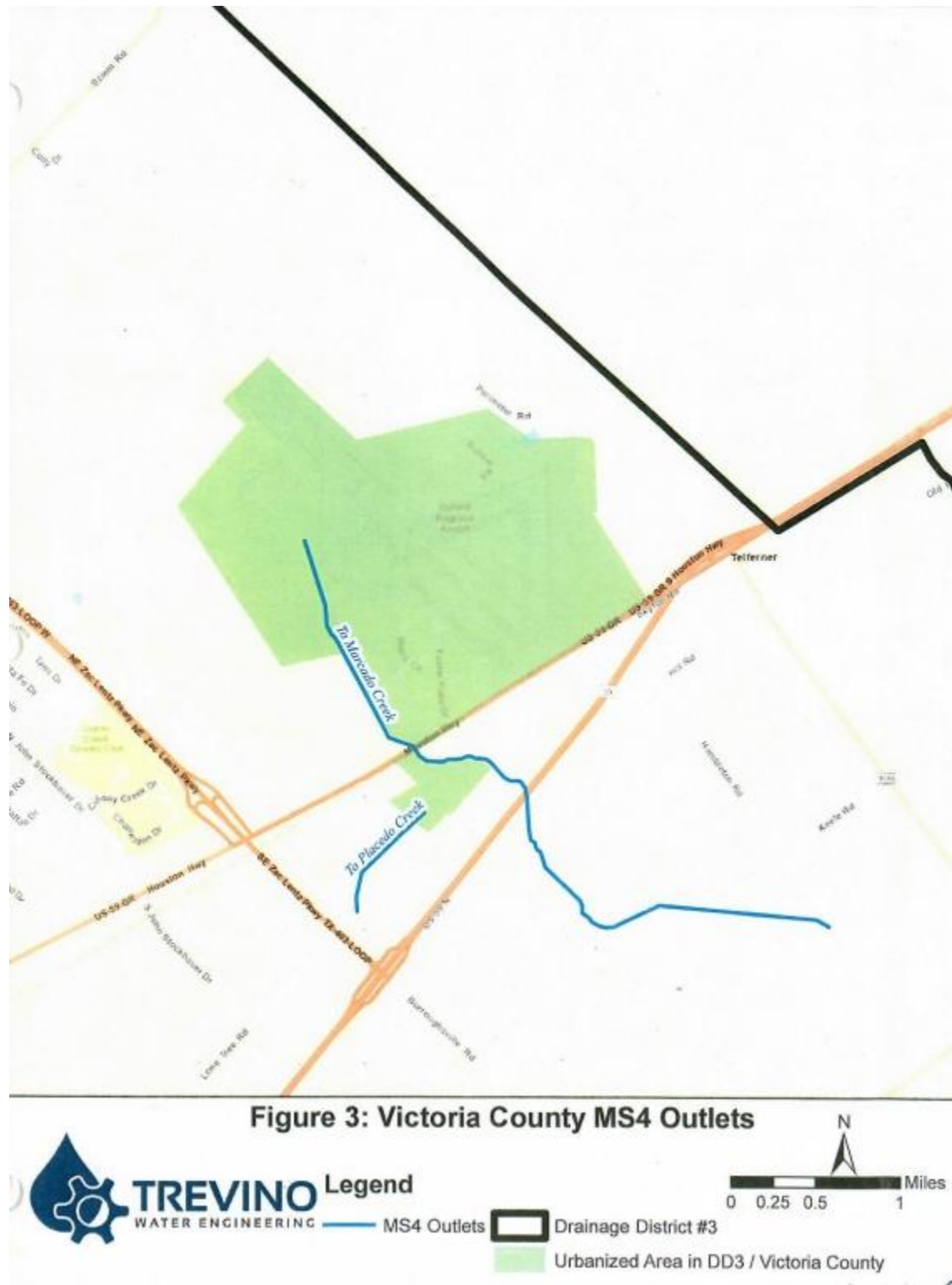
Figure 1 – Brentwood